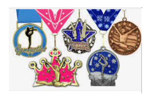
Dates for the Diary

Our Women's Artistic Squad has competed twice this year. In March, 11 gymnasts competed at Heathrow Gymnastics Club and all of them successfully passed their compulsory grades. The team competed again in the London Region WA Zinc Competition on 9th October again at the Heathrow. Some of the gymnasts were competing for the first time and performed brilliantly. The fantastic results included these medals.